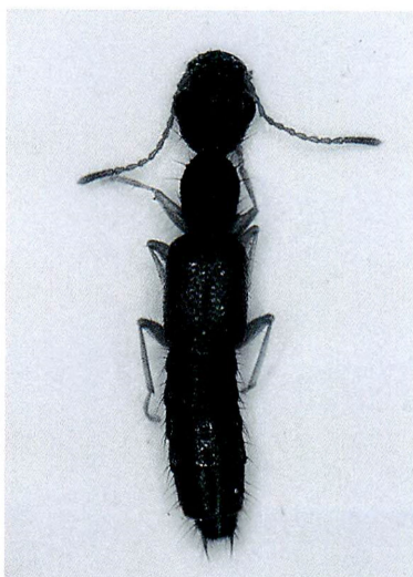
Fig. 1. Astenus shibatai T. ITO.

Before going into further details, I would like to express my cordial thanks to all the persons whose names are given under the “specimens examined.”